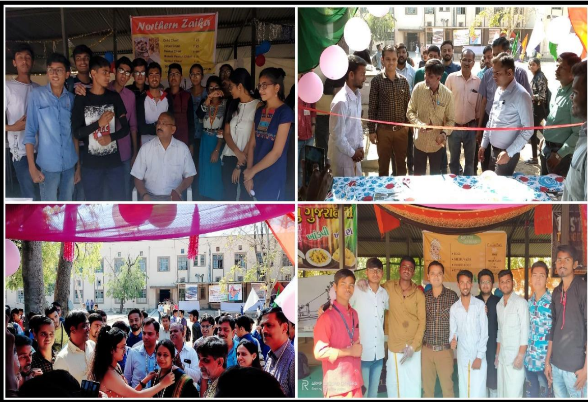
Principal Sir & Faculties welcomed by EBSB Club Students at Food Stalls