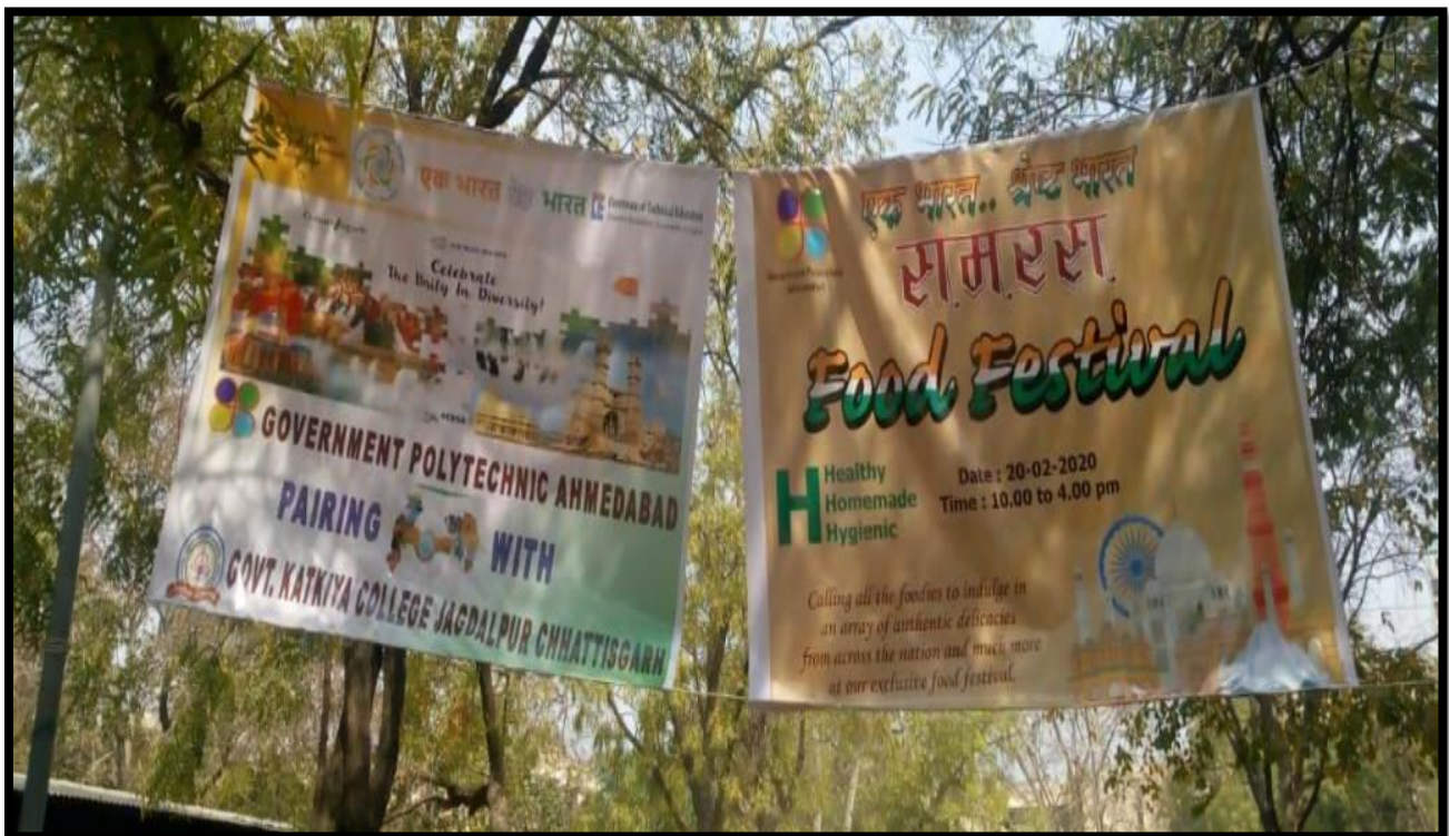
Banners representing the ‘SAMRAS’ Food Festival event and Pairing of GP Ahmedabad of Gujarat with Govt. Kaktiya College of Chhattisgarh state.

The photo gallery of overall event is as below:-