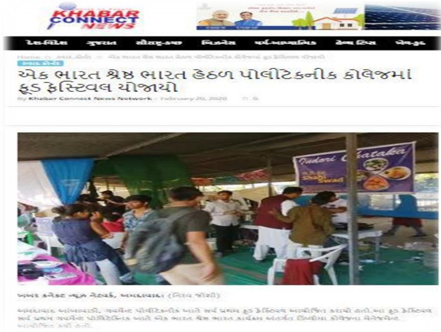
Coverage by Media