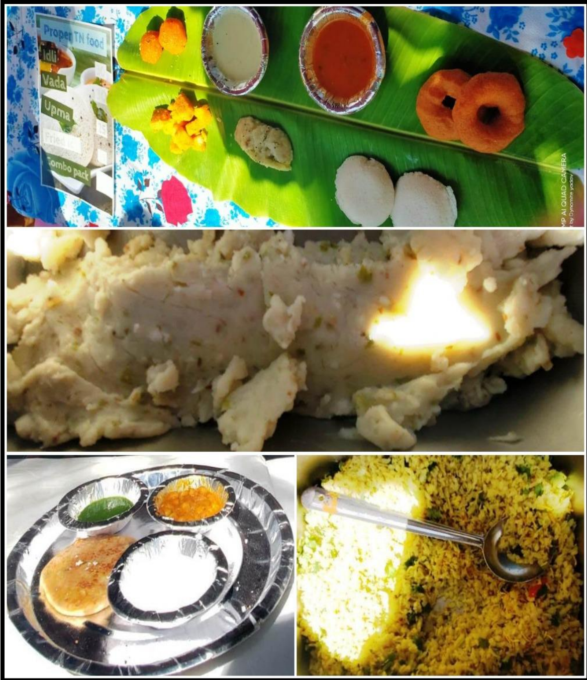
Varieties of Food Dishes