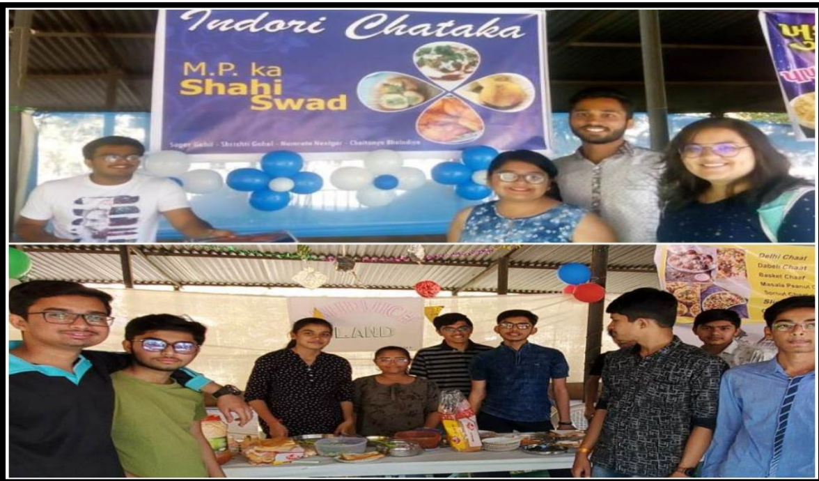
EBSB Club Students at Food Stalls