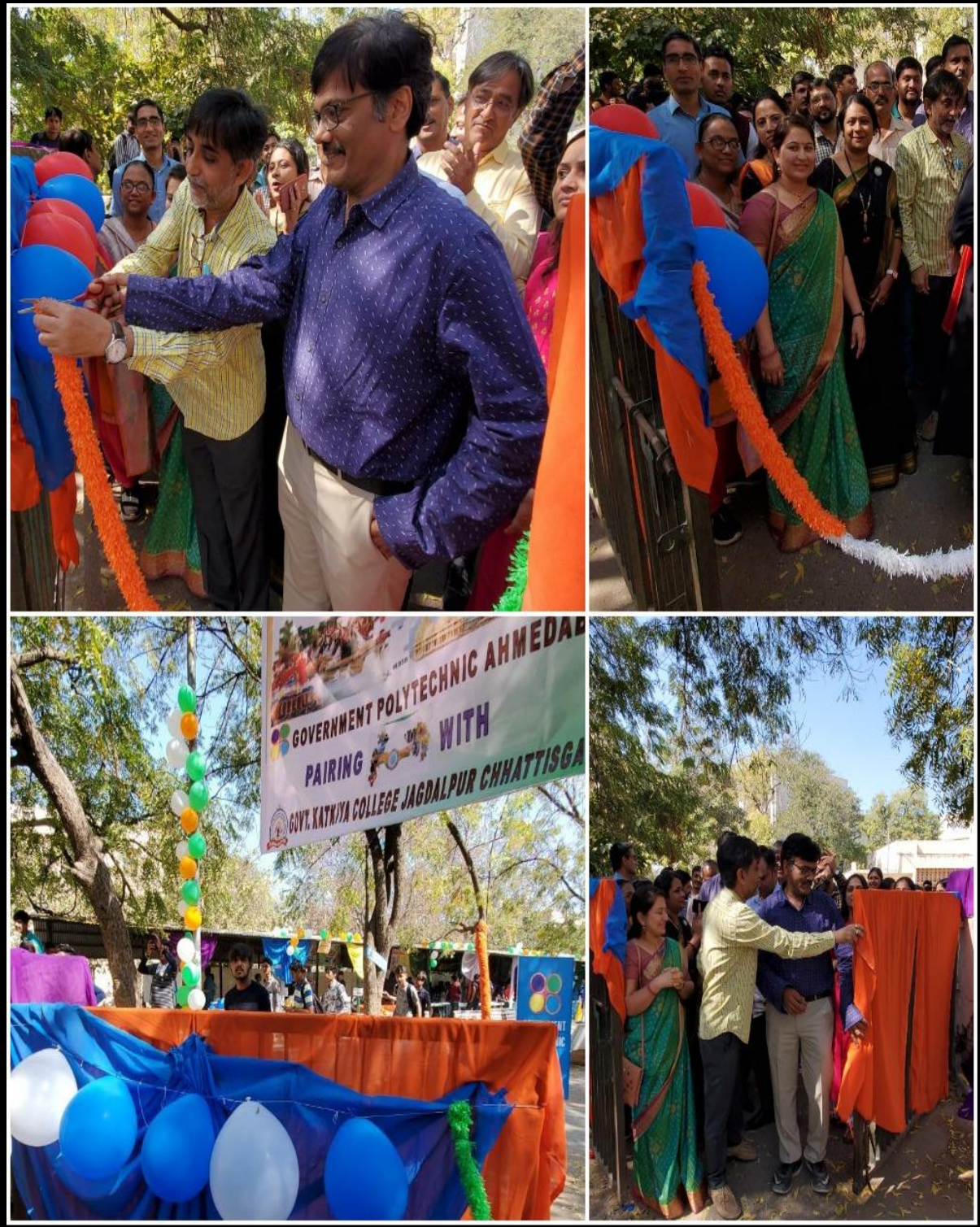
Inauguration of 'SAMRAS' Food Festival event