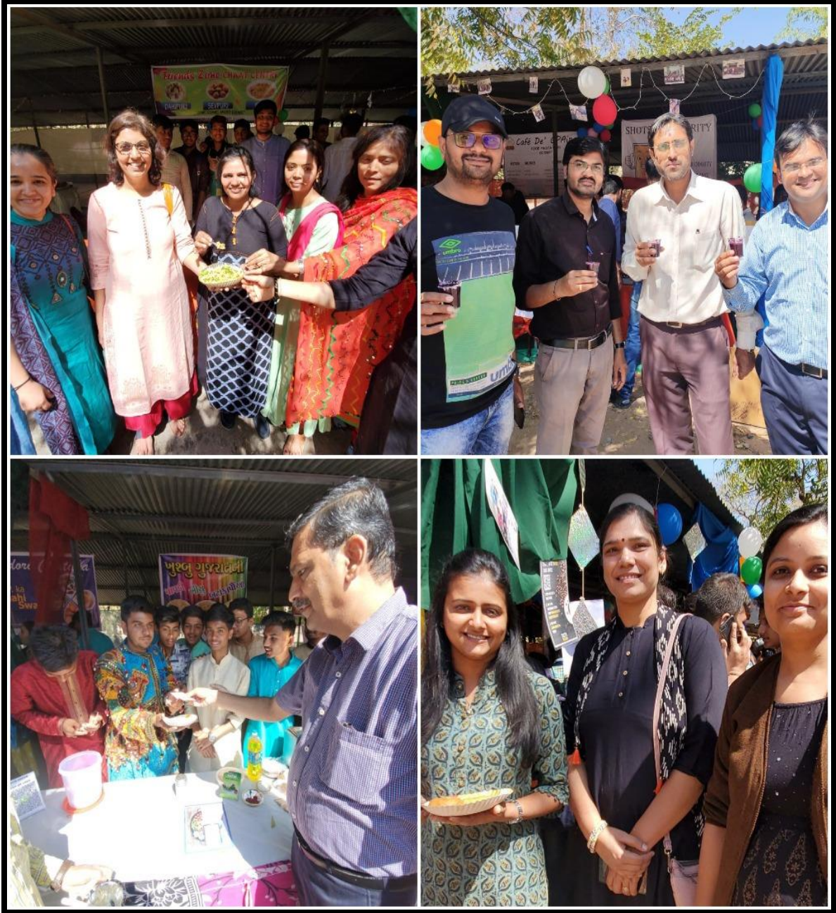
Faculties of various Department enjoying varieties of food dishes