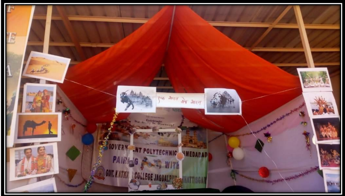
Photography Booth representing the 'SAMRAS' Food Festival event and Pairing of GP Ahmedabad of Gujarat with Govt. Kaktiya College of Chhattisgarh state.