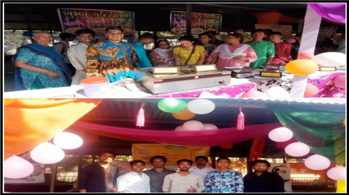
Students representing varieties of food dishes at their Food Stalls