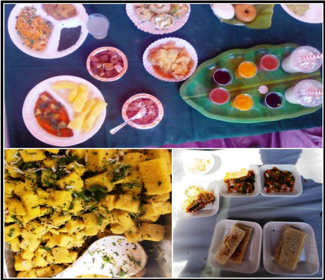
Food delicacies of various States presented together